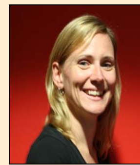
KEW Rosie NCAHS

Evaluate the effectiveness and capacity within Greater Western Area Health to implement the Aboriginal Trainee Program Certificate IV Aboriginal Health Work (Practice stream) 2007-8.